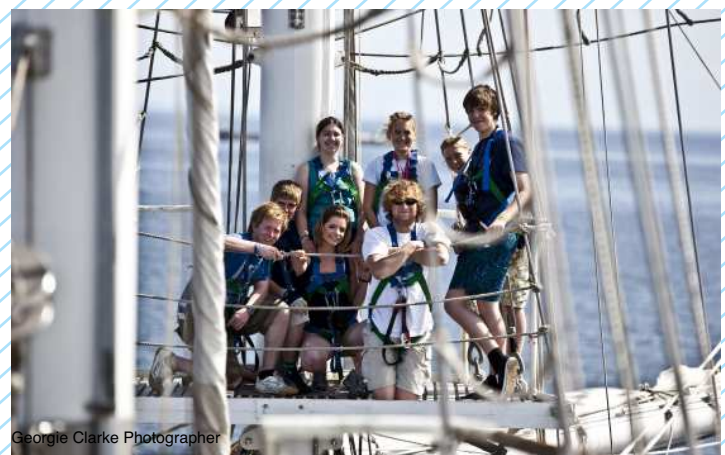
George Clarke Photographer