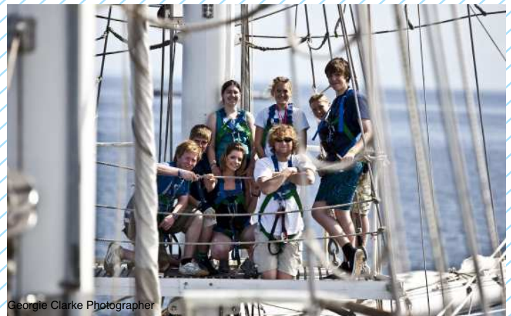
George Clarke Photographer