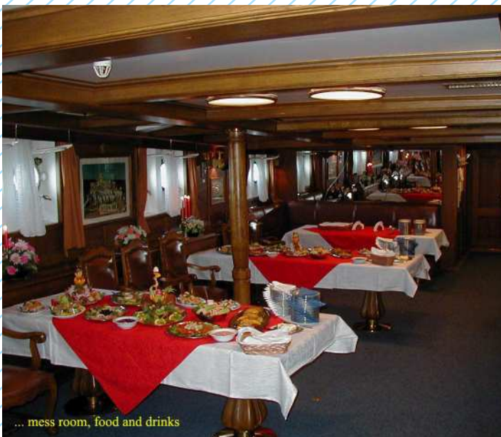
... mess room, food and drinks